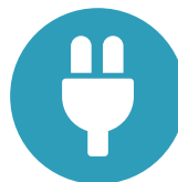
Low power consumption