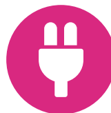
Low power consumption