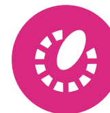
Multi operation modes